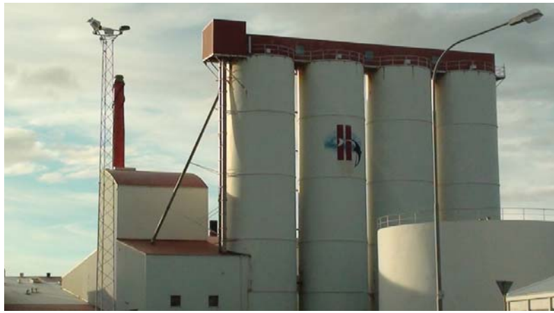
ABOVE: HB Grandi fish meal silos, Akranes.

reservations to the CITES Appendix 1 listings. These exports are therefore illegal. The export of 250kg of frozen whale meat to Latvia in January 2010 64 raises particularly important questions as to the control of trade in whale products in the European Union (EU). A spokesperson for the Latvian Food and Veterinary Authority (PVD) stated that as Iceland is a European Free Trade Association (EFTA) member, the PVD does not have to carry out cargo checks and as such was “not aware of whether and how much whale meat from Iceland had entered Latvia.” 65