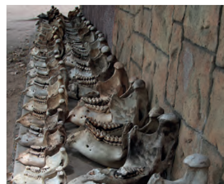
ABOVE: SKULLS OF POACHED ELEPHANTS, NORTHERN MOZAMBIQUE, OCTOBER 2012

of 1,094kg of ivory from the central Maputo stockpile. A security audit of warehouses used to store ivory and rhino horn was subsequently completed in May 2016 and efforts are now underway to centralise the stockpile and improve security.