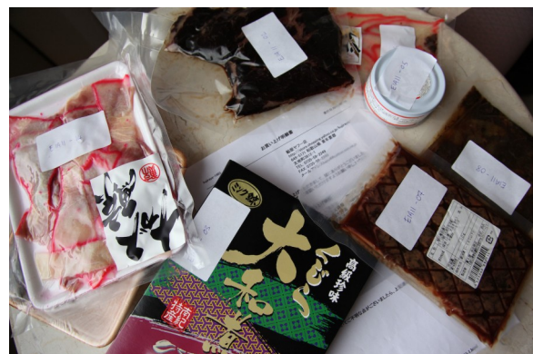
Whale products available via Yahoo! Japan

In March 2012, a search for "whale" on www.store.shopping.yahoo.co.jp showed 249 individual whale products for sale. Many of these products originate from great whales, namely fin, sei, minke, sperm and Bryde's whale, which are all protected species under the moratorium on commercial whaling established by the International Whaling Commission (IWC) since 1986. These whale species are also afforded the highest level of protection by the Convention on International Trade in Endangered Species (CITES), which prohibits international trade. Despite this,