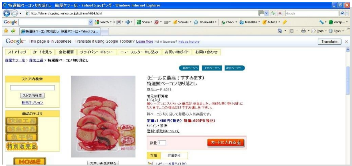
Whale bacon for sale via Yahoo! Japan

dolphin and whale drive hunts exposed in The Cove take place. Despite international protest, the drive hunts continue to subject thousands of dolphins and whales to brutally inhumane killing methods. Recent video footage shows clearly that the Taiji hunters are not interested in improving the killing methods, but seek only to hide the kill. 2