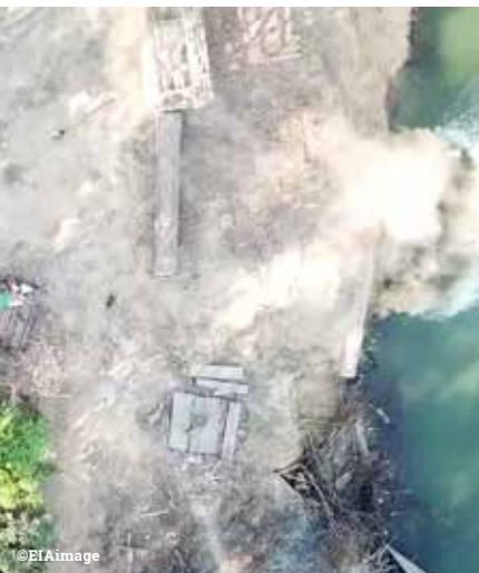
Top and above: Cambodia's timber vanishes by road and by river