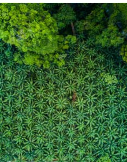
Below: palm oil plantations are swallowing up natural forests

to brief the European Parliament Committee on International Trade (INTA) in its January 2019 considerations regarding ratification of the EU-Vietnam VPA, at which our work was explicitly cited in the EP INTA Committee Rapporteur's report on the VPA.