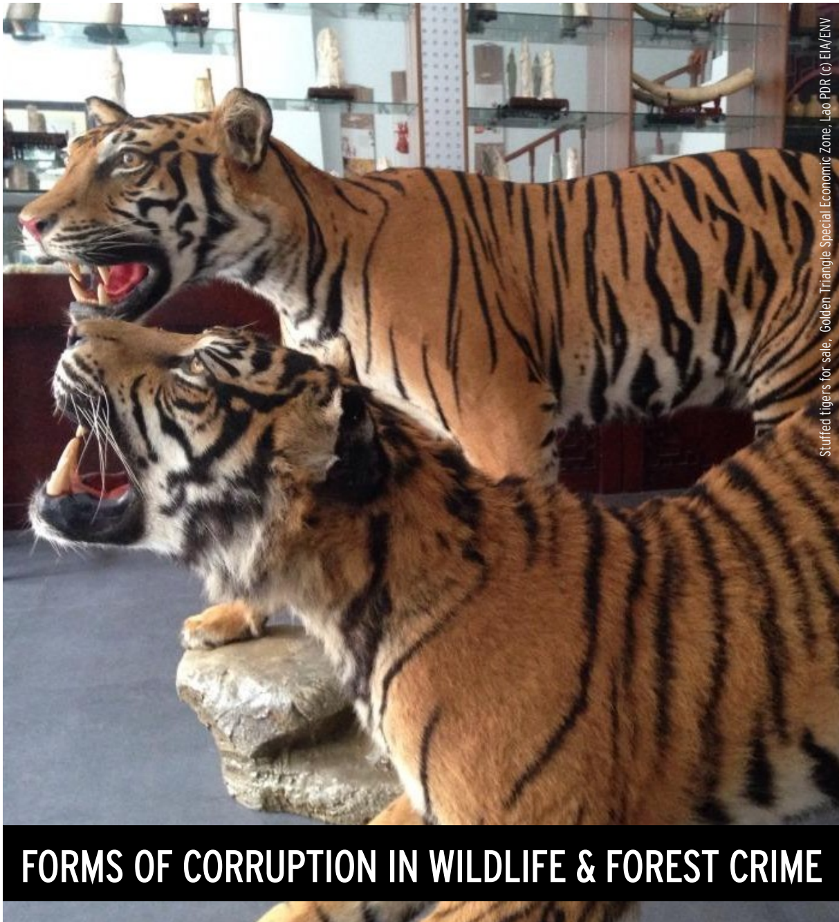
Stuffed tigers for sale, Golden Triangle Special Economic Zone, Lao PDR