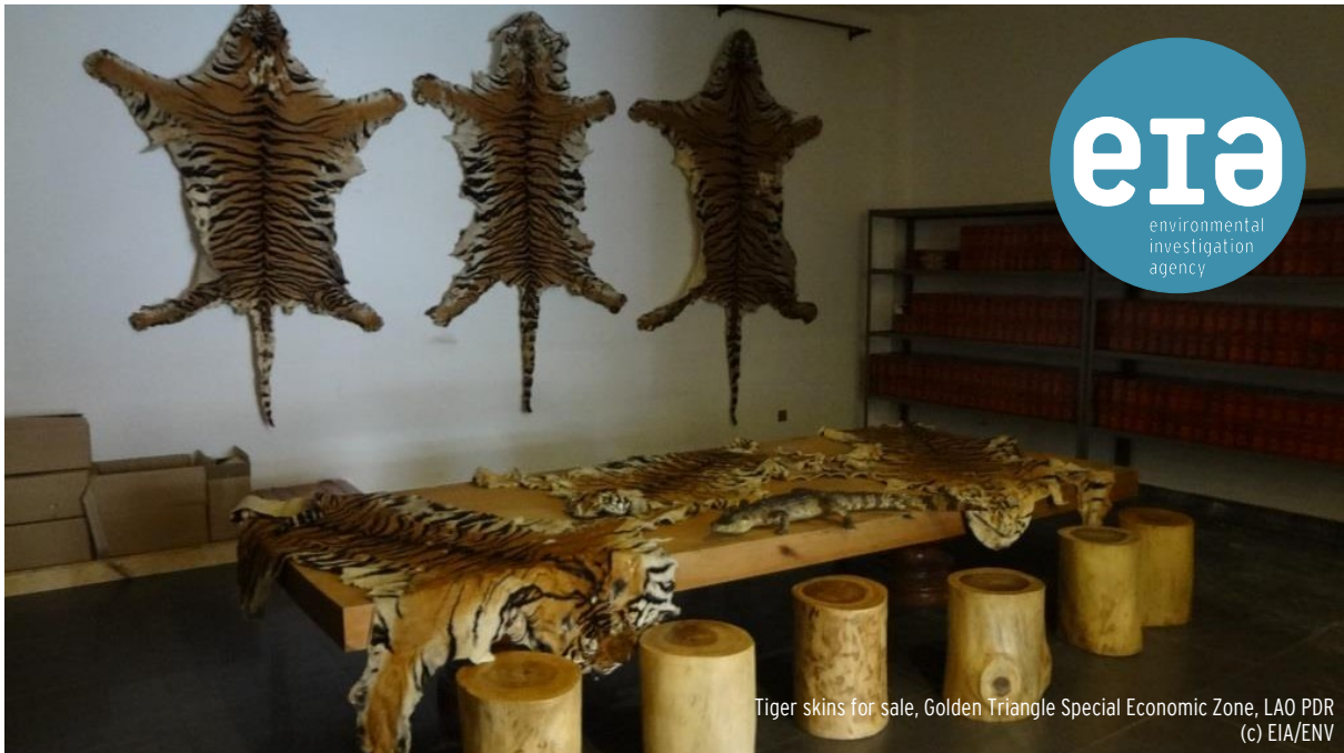
Tiger skins for sale, Golden Triangle Special Economic Zone, LAO PDR