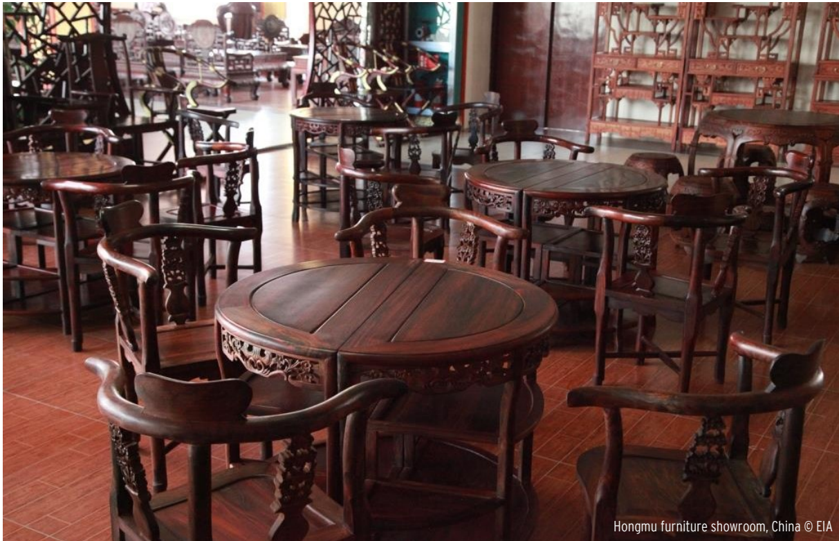
Hongmu furniture showroom, China