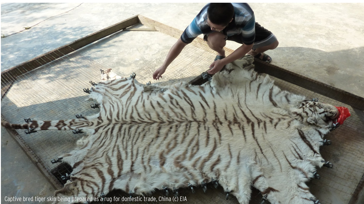
Captive bred tiger skin being prepared as a rug for domestic trade, China