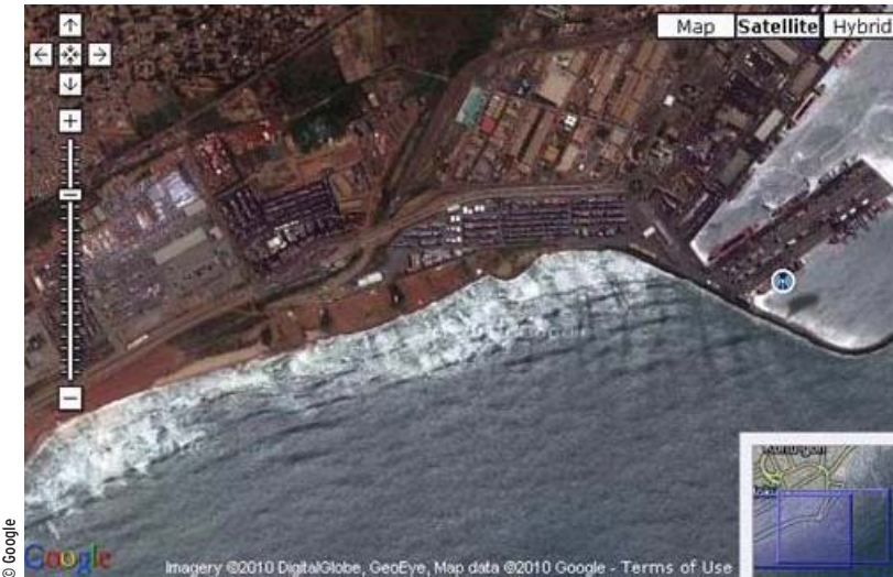
ABOVE: Tracker signal on arrival in Tema Port, Ghana.

were not normal TVs; inside were sophisticated tracking devices, allowing the movement of the sets to be remotely monitored using GSM networks or GPS signals. In addition, the internal workings of the TVs had been deliberately disabled in a way that would only be revealed if a proper test was conducted. The two sets were dropped off in September 2010.