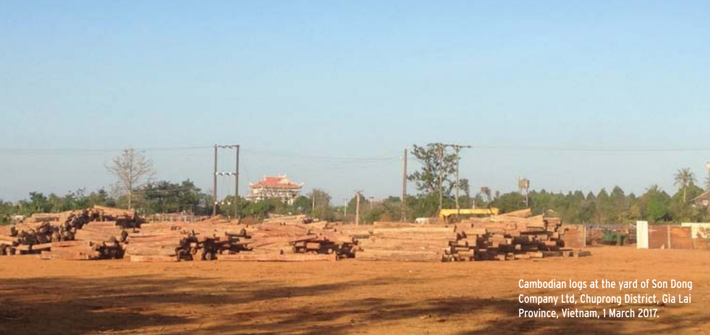
Cambodian logs at the yard of Son Dong Company Ltd, Chuprong District, Gia Lai Province, Vietnam, 1 March 2017.

State involvement in multi-million dollar transnational organised timber crime cannot be accepted by the international community and must not be ignored by the EU.