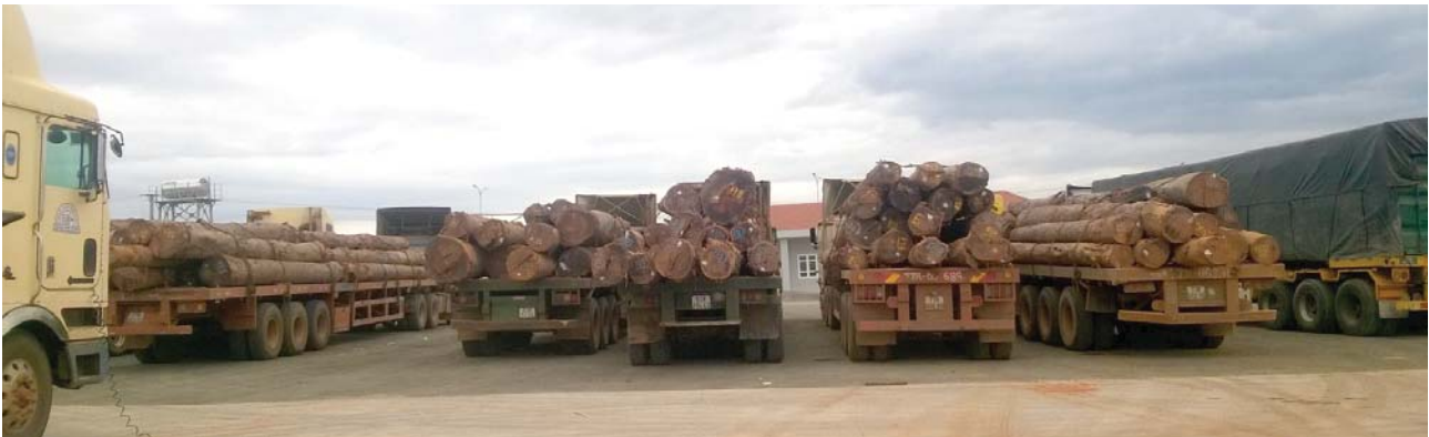
ABOVE: Cambodian logs on trucks in Le Thanh, Gia Lai Province, prior to shipment to customers across Vietnam, December 2016.

rights despite the ban. He said: “The under the table money to the Cambodian side to get the permit to exploit in a forest area is a big amount. They still need to give money in order to be allowed to exploit in an area with big trees, high value timbers. For example, they will have to give 1-2 million USD.”