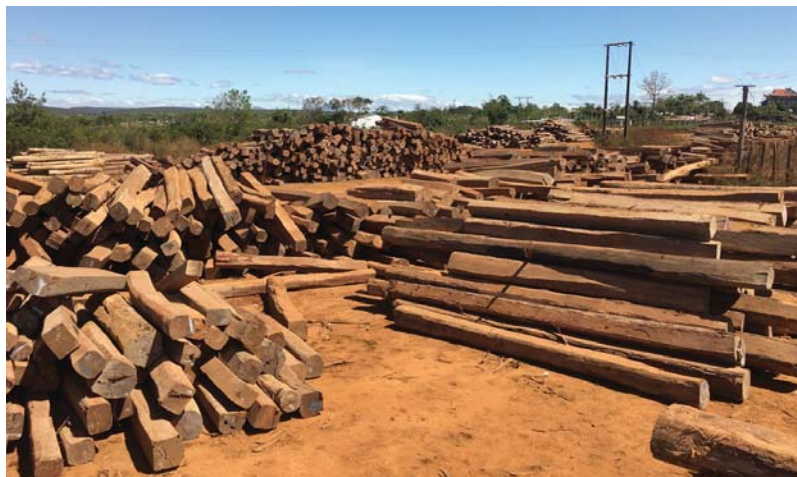
BELOW: Cambodian logs and fitches in the yard of Son Dong Company Ltd, 28 February 2017.