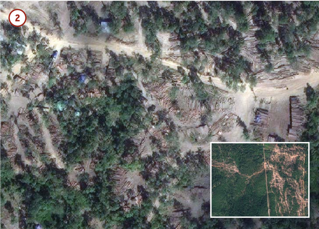
January 7, 2017