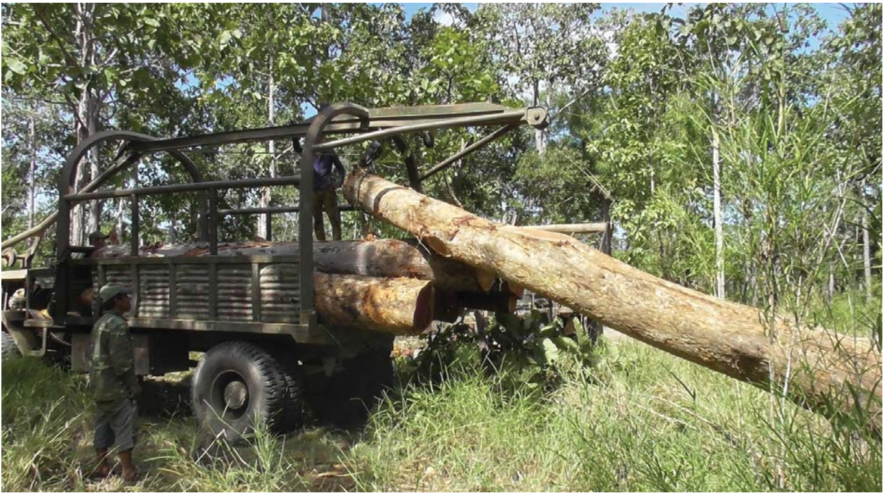
ABOVE: Lagerstroemia and keruing logs being hauled onto a Vietnamese transporter in O'Tang, February 2017.

Local villagers told investigators that in November 2016, a group of Vietnamese timber businessmen arrived in the area and claimed that the forests of O'Tang belonged to a Vietnamese tycoon, after local community representatives were paid $30,000 for logging rights. The money was to be used for upgrading roads and building a village office, with the remainder to be distributed as payments of $73 each to families. Reportedly, 234 families accepted the compensation, believing the logging would occur whether they accepted it or not.