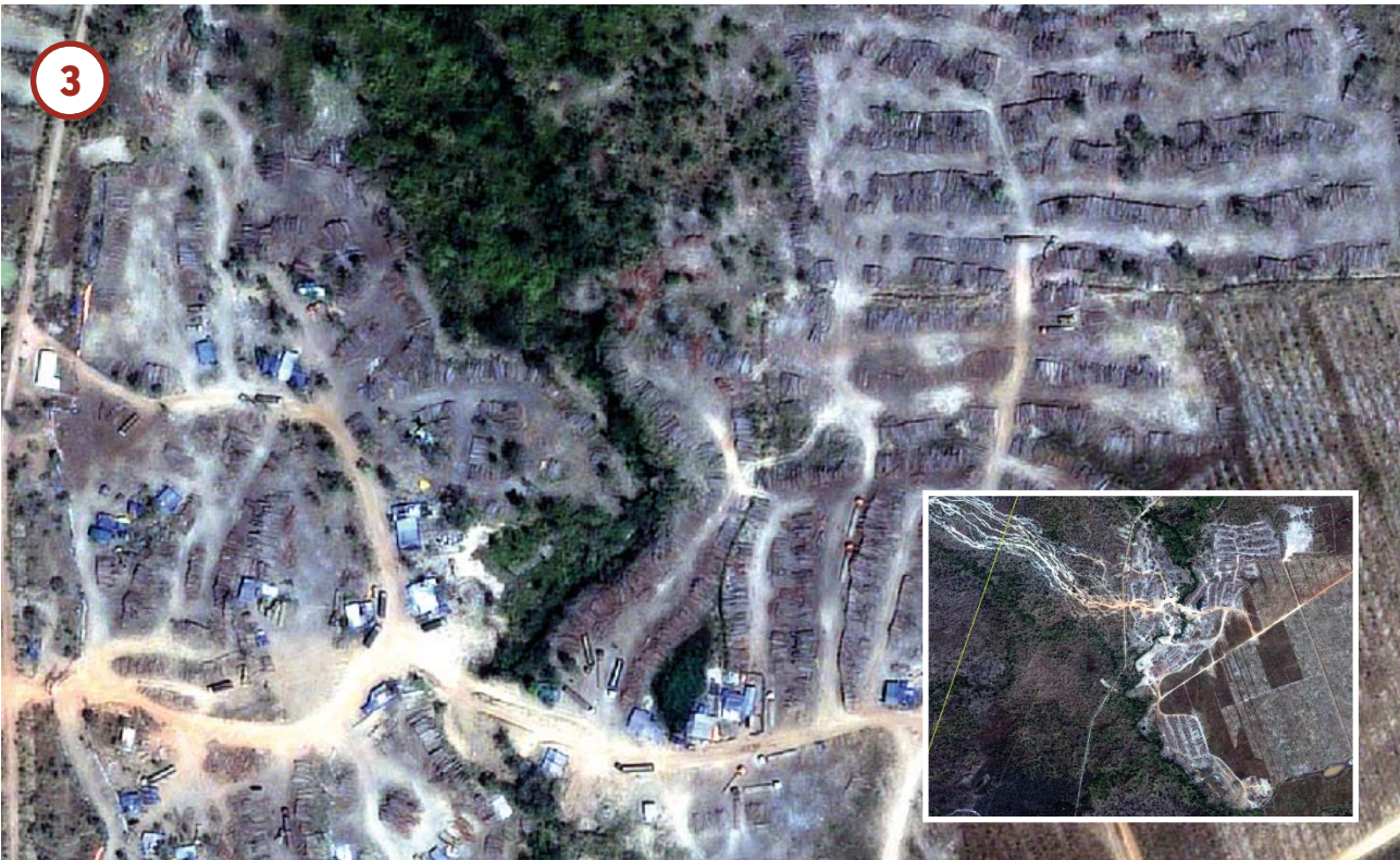
February 6, 2017