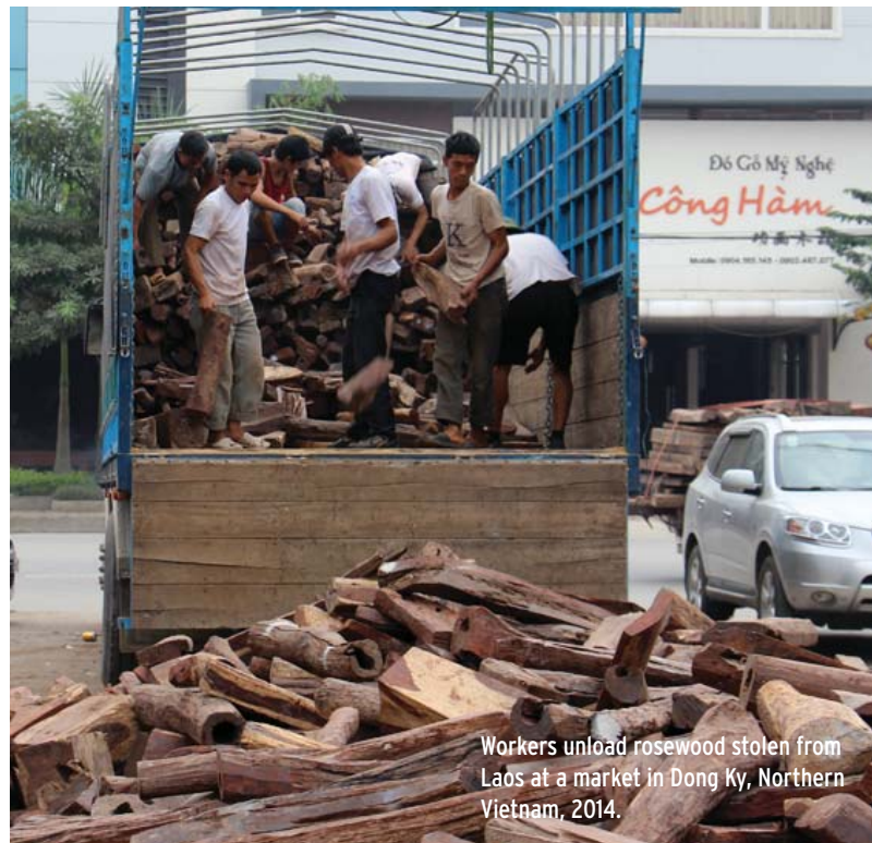
Workers unload rosewood stolen from Laos at a market in Dong Ky, Northern Vietnam, 2014.

In 2015, Vietnam imported 590,000m 3 (roundwood equivalent) of logs and sawn wood from Cambodia, a massive 800 per cent increase on 2013 imports. Log imports alone increased from just 383m 3 in 2014 to 57,700m 3 in 2015, despite Cambodia banning the export of raw logs.