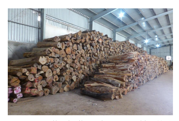
Rosewood logs stored in a warehouse, Dong Ha, Vietnam

At CoP16, China's CITES MA tabled a proposal to improve procedures for international cooperation in permit verification, leading to Resolution Conf. 12.3 (Rev. CoP16) which made recommendations to prevent the increasing use of false and invalid permits. Specifically, it recommends: Parties not authorise the import of any specimen if they have reason to believe that it was not legally acquired in the country of origin (II); Parties exchange issued and/or accepted permits or certificates to verify their authenticity; Parties refuse to accept any permit or certificate that is invalid, including authentic documents ... that contain information that brings into question the validity of the permit or certificate (XIV); and