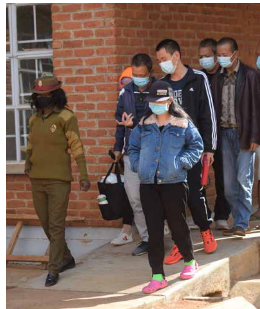
Left: defendants leave the court in Malawi