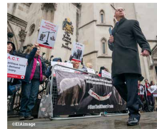
Right: protesters outside the High Court in London

"The next challenge to help give the world's precious elephants a future is to close the EU's ivory markets." ●