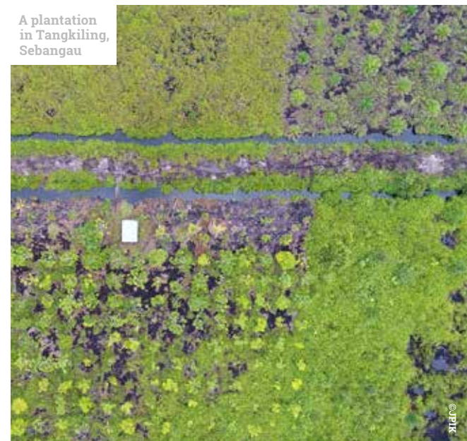
A plantation in Tangkiling, Sebangau

Further, the moratorium has only the status of a presidential instruction and must be enshrined in law to guarantee enforcement. ●