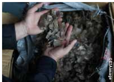
Below: seized pangolin scales