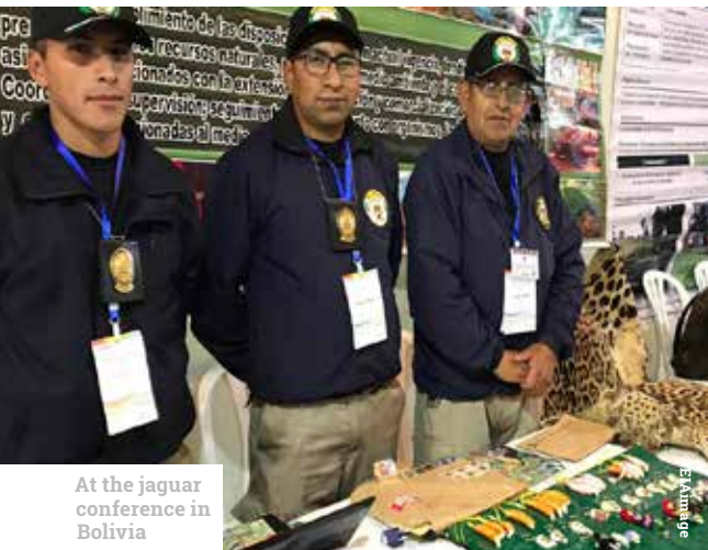
At the jaguar conference in Bolivia