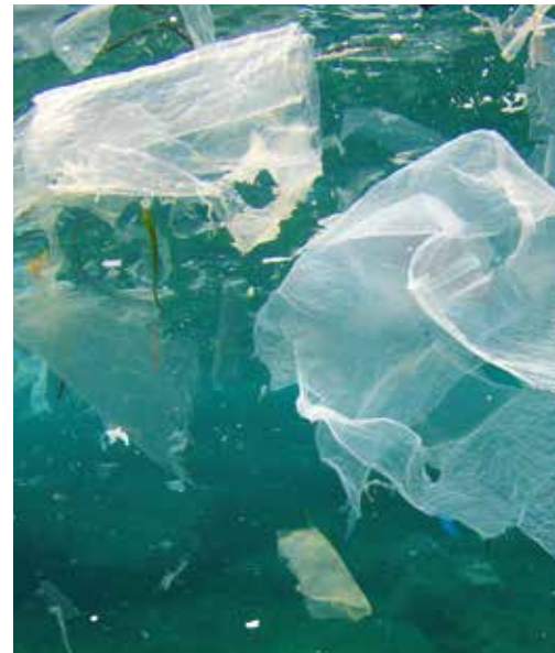
Right: plastic pollution is killing our oceans