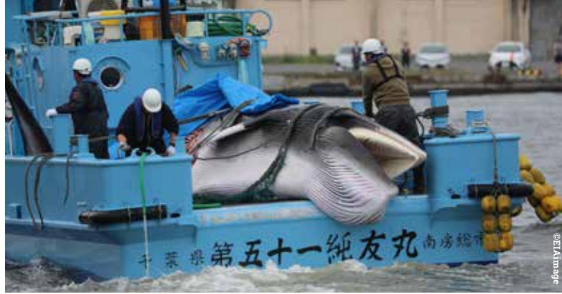
Above: the first minke whale is landed in Kushiro, Japan

The country's Fisheries Agency has set itself a commercial catch quota for 2019 of 52 minke whales, 150 Bryde's whales and 25 sei whales.