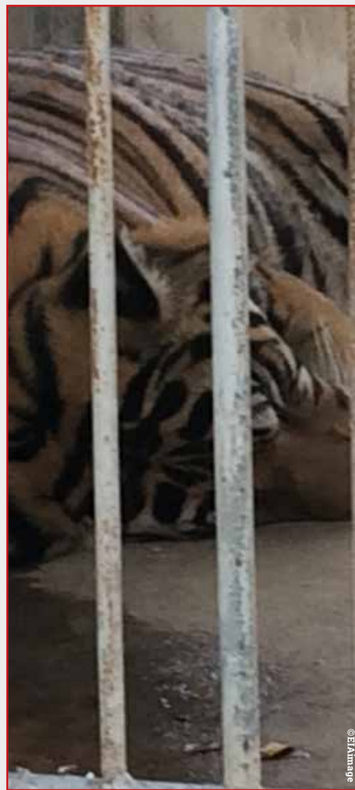
Left: tiger in captivity, Laos

Instead, the country avoided formal sanction, albeit with a clear indication from the EU that it expects to see actual progress by early 2020.