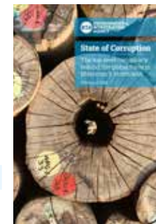
Upper right: front cover of our 'State of Corruption' report

We naturally stand by the findings of our report, which was the result of an exhaustive and comprehensive investigation, using techniques familiar to experienced and competent journalists.