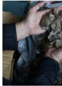
Above: a ground pangolin roams the savannah

However, although the highest level of protection might