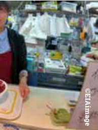
Below: the first whale meat goes on sale at Washo Market