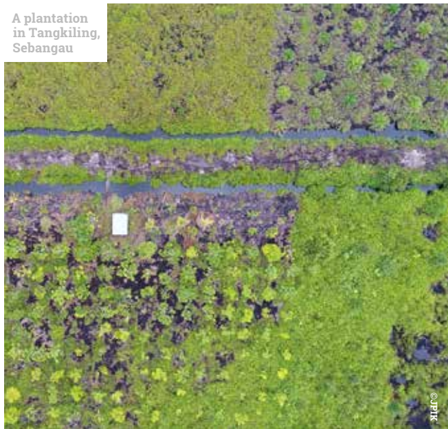
A plantation in Tangkiling, Sebangau

Further, the moratorium has only the status of a presidential instruction and must be enshrined in law to guarantee enforcement. ●