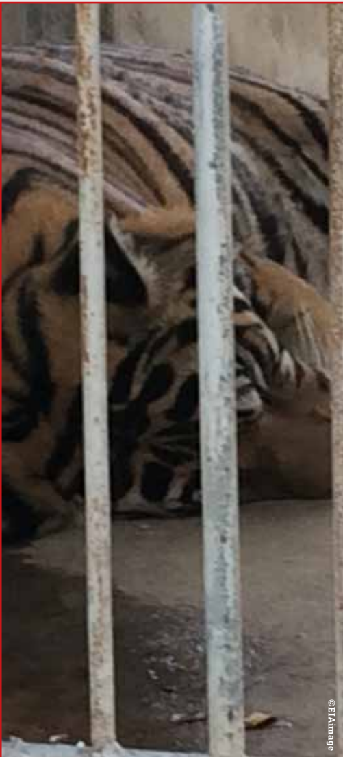
Left: tiger in captivity, Laos

Instead, the country avoided formal sanction, albeit with a clear indication from the EU that it expects to see actual progress by early 2020.