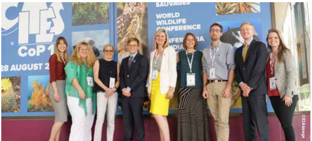
Below: the EIA team at CITES CoP18 in Geneva