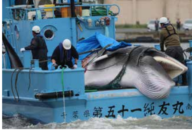
Above: the first minke whale is landed in Kushiro, Japan

The country's Fisheries Agency has set itself a commercial catch quota for 2019 of 52 minke whales, 150 Bryde's whales and 25 sei whales.