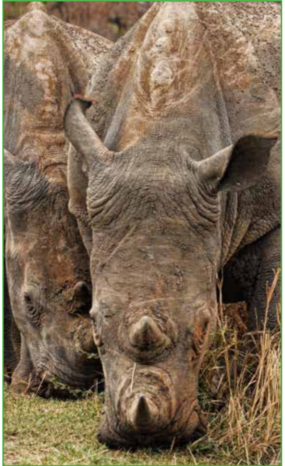
Right: a pair of white rhinos

Vietnam also came under heavy scrutiny at the opening Standing Committee for its continued role in international rhino horn trafficking – if the country fails to submit a detailed report in 2020 on its actions to combat the problem, it could face compliance proceedings.