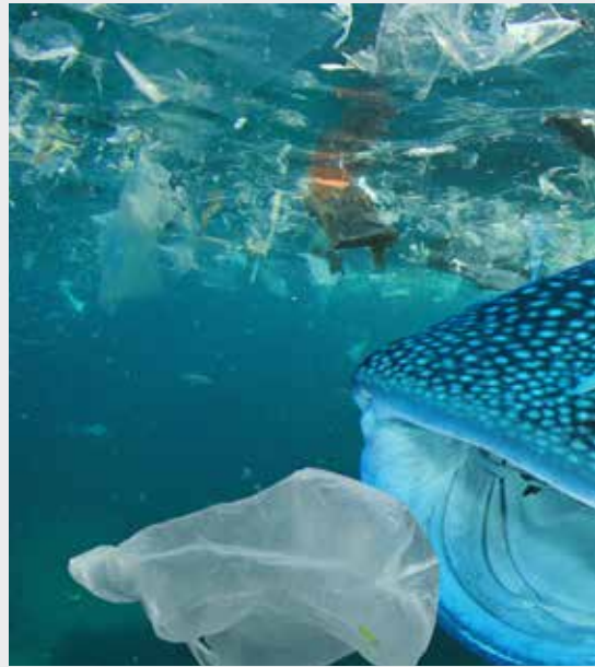
Above: Plastic remains a serious threat to marine life

number of commonly littered plastic items, including bags, water bottles, coffee cups and single-use plastic cutlery, are being sold or even given away free by supermarkets, with limited plans to act on most of them.