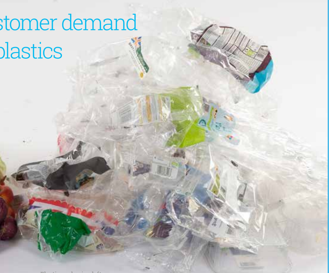
Plastic packaging left from purchasing the fruit and vegetables shown

through campaigning against single-use plastics such as carrier bags, microbeads in rinse-off products and plastic packaging, but there is still work to do.