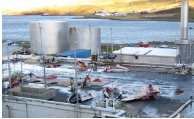
Whale slaughtering activity in Iceland