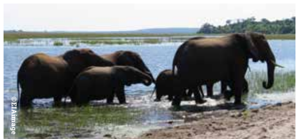
Below and far left: Elephants in Chobe National Park, Botswana

Once the Government's consultation on the Ivory Bill actually got under way, we led a coalition of organisations to spread awareness and urge people to participate in support of a ban. ●