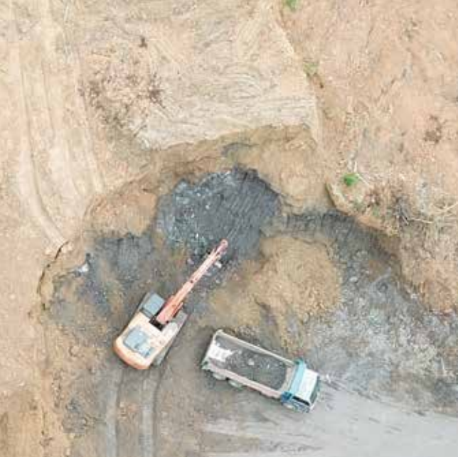
Above: deforestation in progress