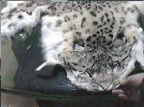
Left: undercover footage of the big cat trade captured by our investigators in China

“I also knew if I didn't get back into the field again soon, the fear would consume me.”