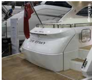
Above and below: yachts at this year's London Boat Show