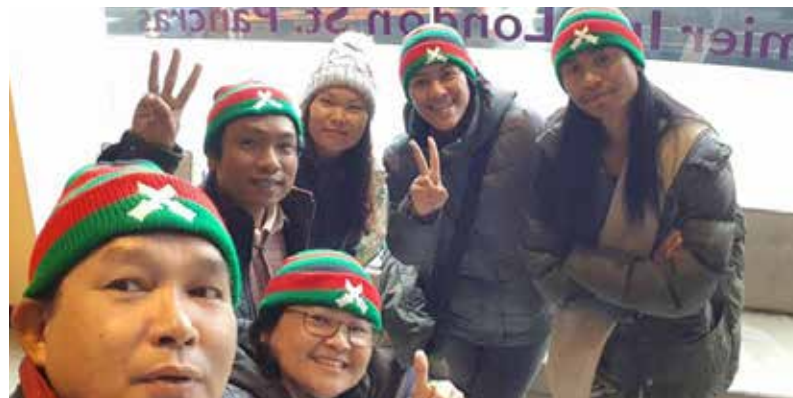
The Myanmar delegation visited Brussels to share their opinions on protecting their besieged forests

Our visitors were here to present their thoughts and concerns regarding the current situation they and their communities face on the ground. These issues include illegal logging, land-grabbing, natural resource extraction and conflict.