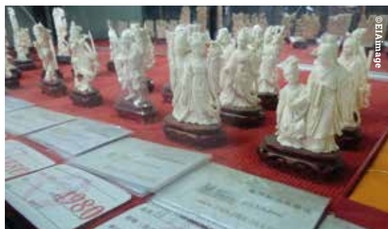
Above: an elephant bathing in Botswana Above left and left: after China's ban, ivory will no longer be able to be sold legally

certification' or 'This ivory is legal', they are tricking you into breaking the law!"