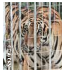
Above: tiger farms still operate in Laos Top and left: skins and stuffed tigers for sale in the GTSEZ