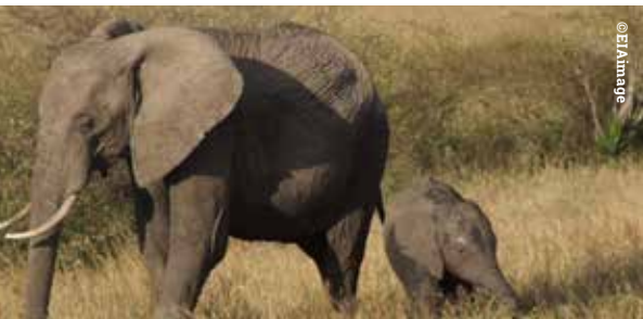
Above: elephants in their natural habitat Far right: soon, jewellery made out of ivory won't legally be able to be sold in the UK

English, French, Spanish, Portuguese, Swahili, Mandarin, Cantonese, Thai and Vietnamese language versions will ensure it can be used globally. ●