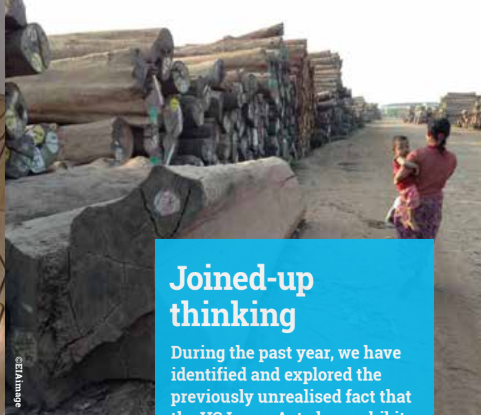
Top right: a log yard in Myanmar