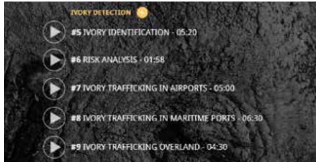
Above: some of the modules available Right: footage from the tool

We travelled to more than 12 countries in Africa, the Middle East and Asia, interviewing people from rangers in the field to customs officers and police.