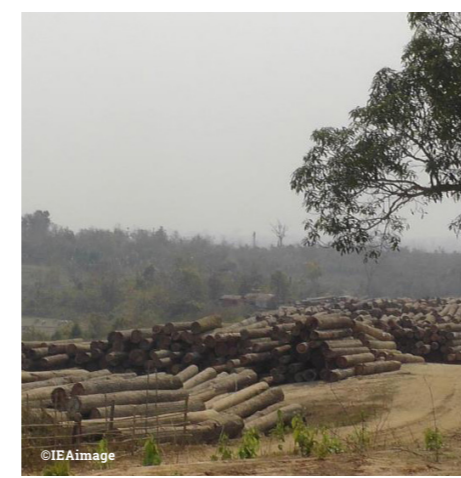
Below: Myanmar Timber Enterprise log depot, Sagaing Division, Myanmar

involved organising for Indonesian activists to travel to EU countries to explain first-hand the impact of illegal logging on their communities and to call for the EU to take action.