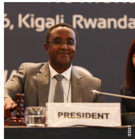
Below: The official adoption of the Kigali Amendment during the 28th meeting of Parties to the Montreal Protocol.

We have been engaged with the Montreal Protocol since the mid-1990s, building up a wealth of expertise and respect. The Protocol was established in 1987 to regulate