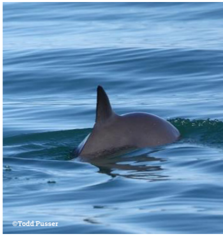
Below: The vaquita is the world's smallest and most endangered cetacean species

Our undercover investigators returned to southern China to further infiltrate the criminal groups trafficking totoaba maw, uncovering the role of Jinping Market in the coastal town of Shantou as the main hub for the trade, as well as sales via auction houses. The information was shared with enforcement agencies and we published a report entitled Collateral Damage .