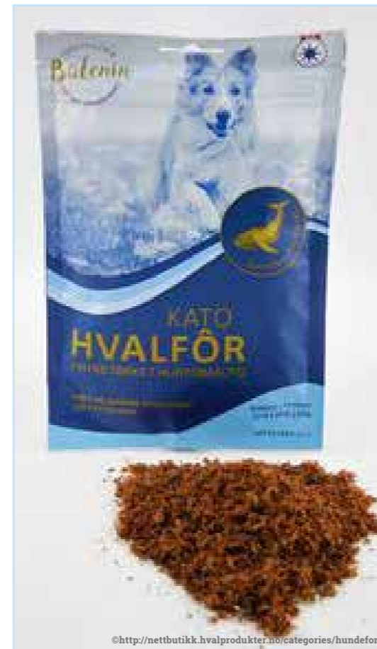
Above: Myklebust Hvalprodukter dog food products have been developed as part of the effort to offset the limited demand for whale meat for human consumption