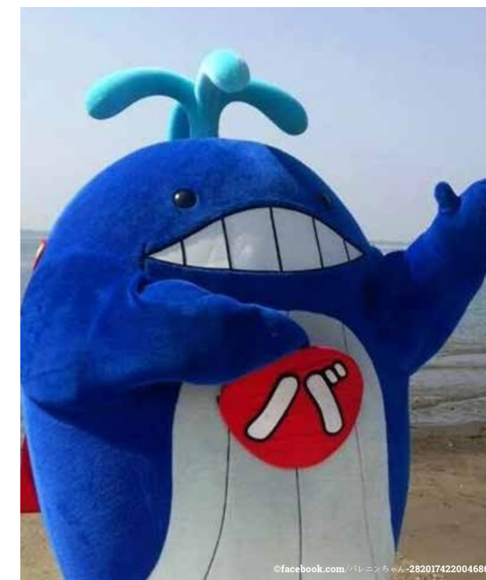
Above: Mascot character 'Balenine-chan', used to deliver pro-whaling information on social media 107

Although viewed as the main market globally for edible whale products, whale meat is not commonly eaten in Japan. In 2014, it was estimated that average annual consumption was just 30 grams (one ounce) per person. 105 This is despite significant marketing efforts to promote whale products to Japanese consumers, with festivals held to showcase whale cuisine and special events aimed at promoting whale meat to children. 106