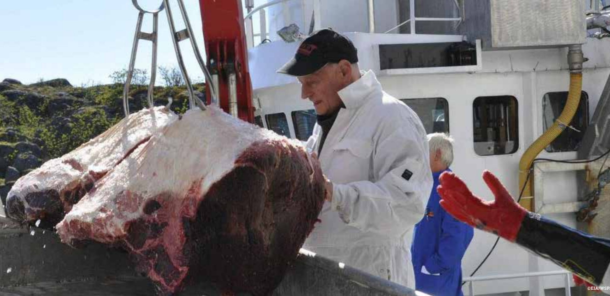
Above: Whale meat being offloaded by a Norwegian whaling vessel. Only the leanest meat is used for human consumption, while the remaining meat, blubber and bones are used for animal feed, or discarded