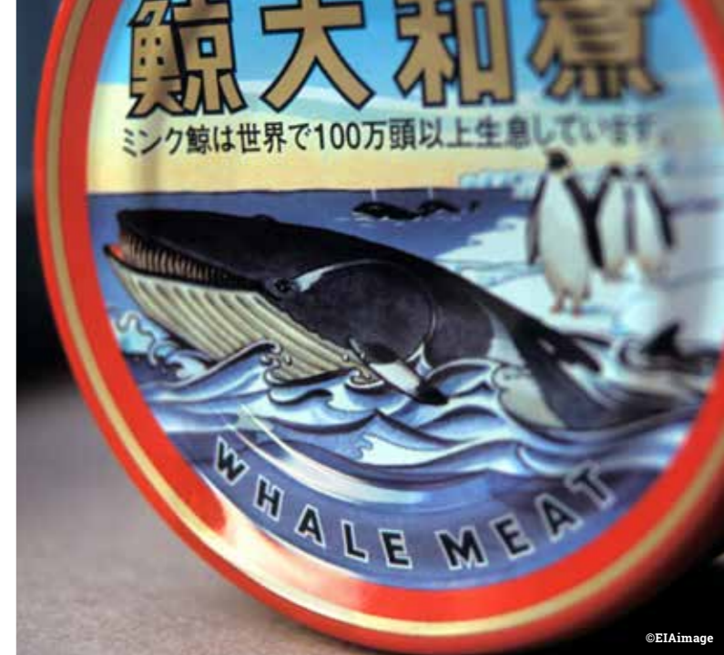
Above: Canned whale meat sold by Nippon Suisan, historically one of Japan's largest whaling companies which continued as a shareholder of Kyodo Senpaku

In 2005, Japan implemented the second phase of the special permit whaling programme, JARPA II, significantly increasing the catch limits to 850 minke whales, 50 fin whales and 50 humpback whales, although no humpbacks were ever taken. 80 After the International Court of Justice (ICJ) ruled in 2014 that Japan's Antarctic whale hunt was not 'for purposes of scientific research', Japan officially ended JARPA II and no hunt took place during the 2014/15 Antarctic summer. 81 This respite for the whales was short-lived, however, as Japan almost immediately proposed a new 12-year lethal research programme, the New Scientific Whale Research Program, in the Antarctic Ocean (NEWREP-A) with a plan to catch up to 333 minke whales each year. 82 In total, Japan has killed 15,613 whales in the Antarctic since the moratorium was implemented (see Table 3).