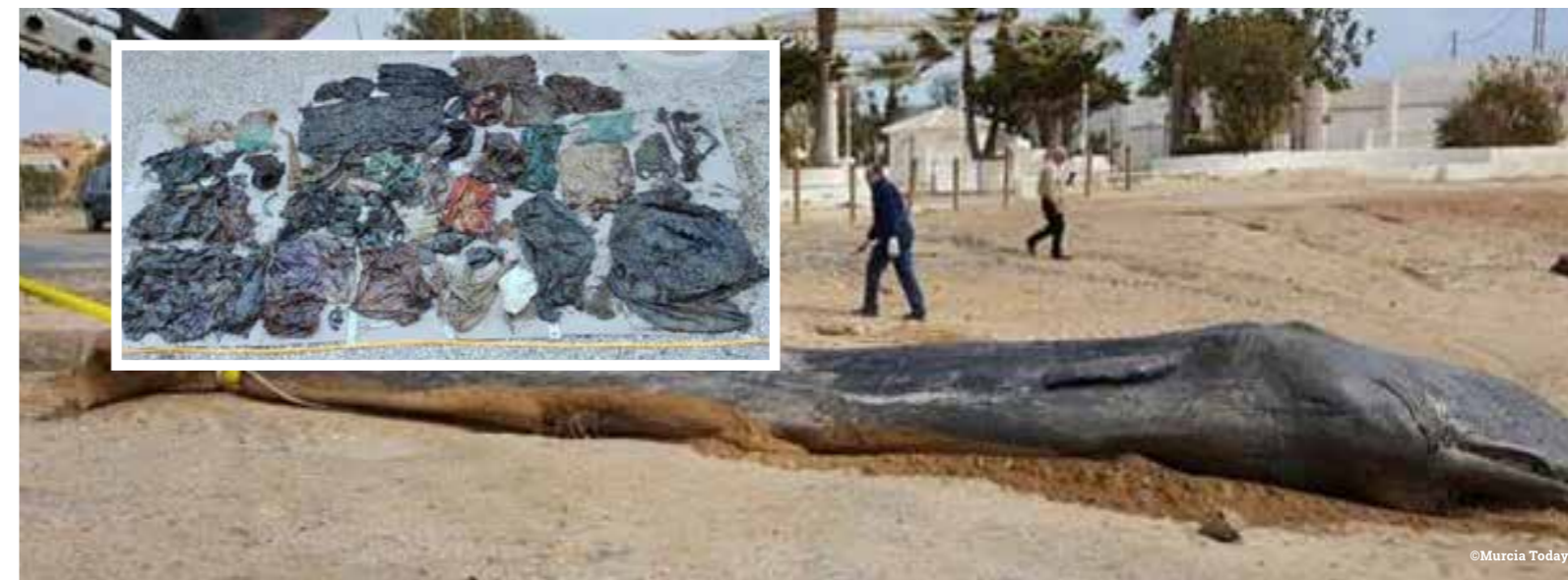
Below: Sperm whale on Spanish shore killed in 2018 by gastric shock caused by ingesting 29kgs of plastic waste

These examples provide insight into the increasingly fragile state of the world's ocean. The commercial whaling moratorium plays a critical role in limiting further avoidable pressures and must be maintained to prevent further risks to cetacean populations.