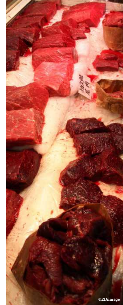
Above: Icelandic fin whale meat on sale in Tokyo, Japan