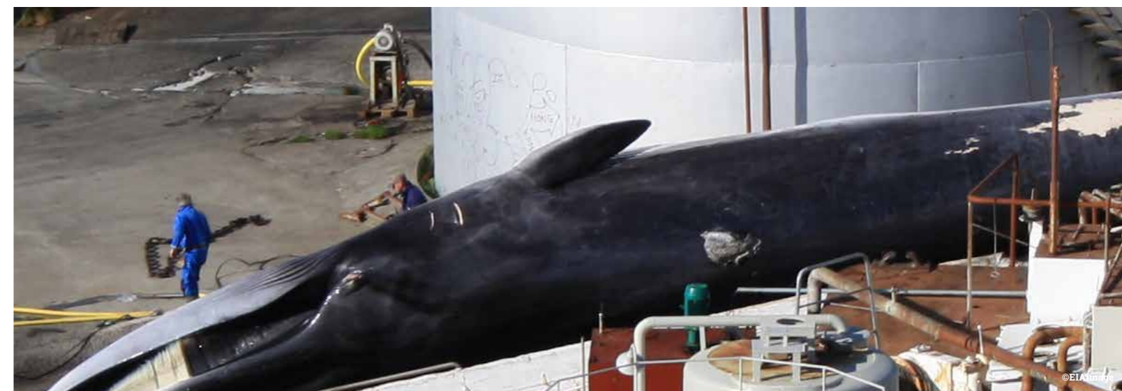
Below: Fin whale killed in Iceland, 2011