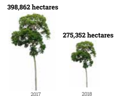
Graph 2: Average exposure to deforestation risk in Papua for the ten traders

Using these approaches, the traders have significantly decreased their exposure to deforestation risks in Papua. EIA’s analysis indicates that on average the surveyed traders’ exposure to deforestation risk in Papua reduced from 398,862 ha in 2017 to 275,352 ha as of the end of 2018, a 30 per cent (or 123,509 ha) reduction in exposure to deforestation risk (Graph 2).