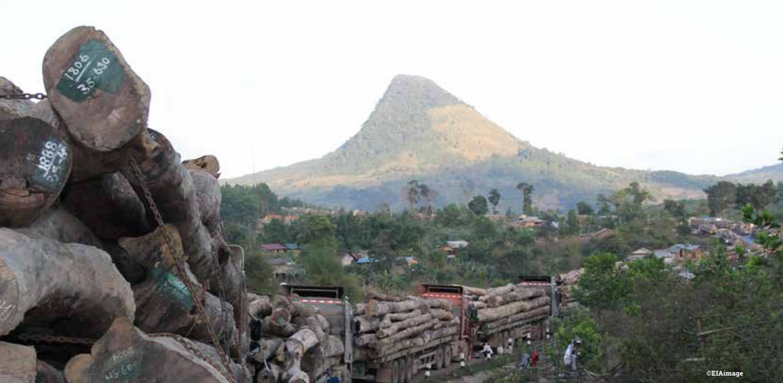
La Ley Border, Laos PDR, 2015