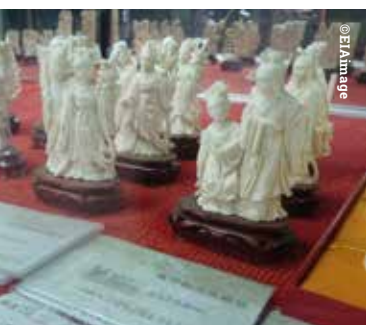
Above: an elephant bathing in Botswana Above left and left: after China's ban, ivory will no longer be able to be sold legally

certification' or 'This ivory is legal', they are tricking you into breaking the law!"