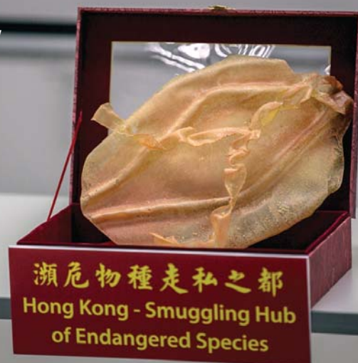
Totoaba maw display at press conference held by Greenpeace East Asia.

Some traders are still openly displaying totoaba maws; however many traders are reluctant to sell their stock. This may be due to the drastic fall in prices for totoaba maws rather than any enforcement measures carried out. Many traders are holding on to stock, banking on a future hike in price which will allow them to recoup their investment.