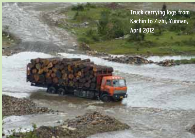
Truck carrying logs from Kachin to Zizhi, Yunnan, April 2012

Out of work and desperate for money, the man was recruited by a logging company called Nujiang Sanyuan Wood to cut trees in Myanmar. He was offered RMB100 ($15) a day. He joined a group of 29 other loggers and embarked on a trek by foot to the logging site, which took seven days without sleep. After working for a week, the group was attacked by soldiers and forced to flee. It took him 10 days on foot to get back to Pianma. He was waiting in town in the hope of being reunited with his colleagues, but after a week none of them had returned. He said he would never go back to Myanmar.