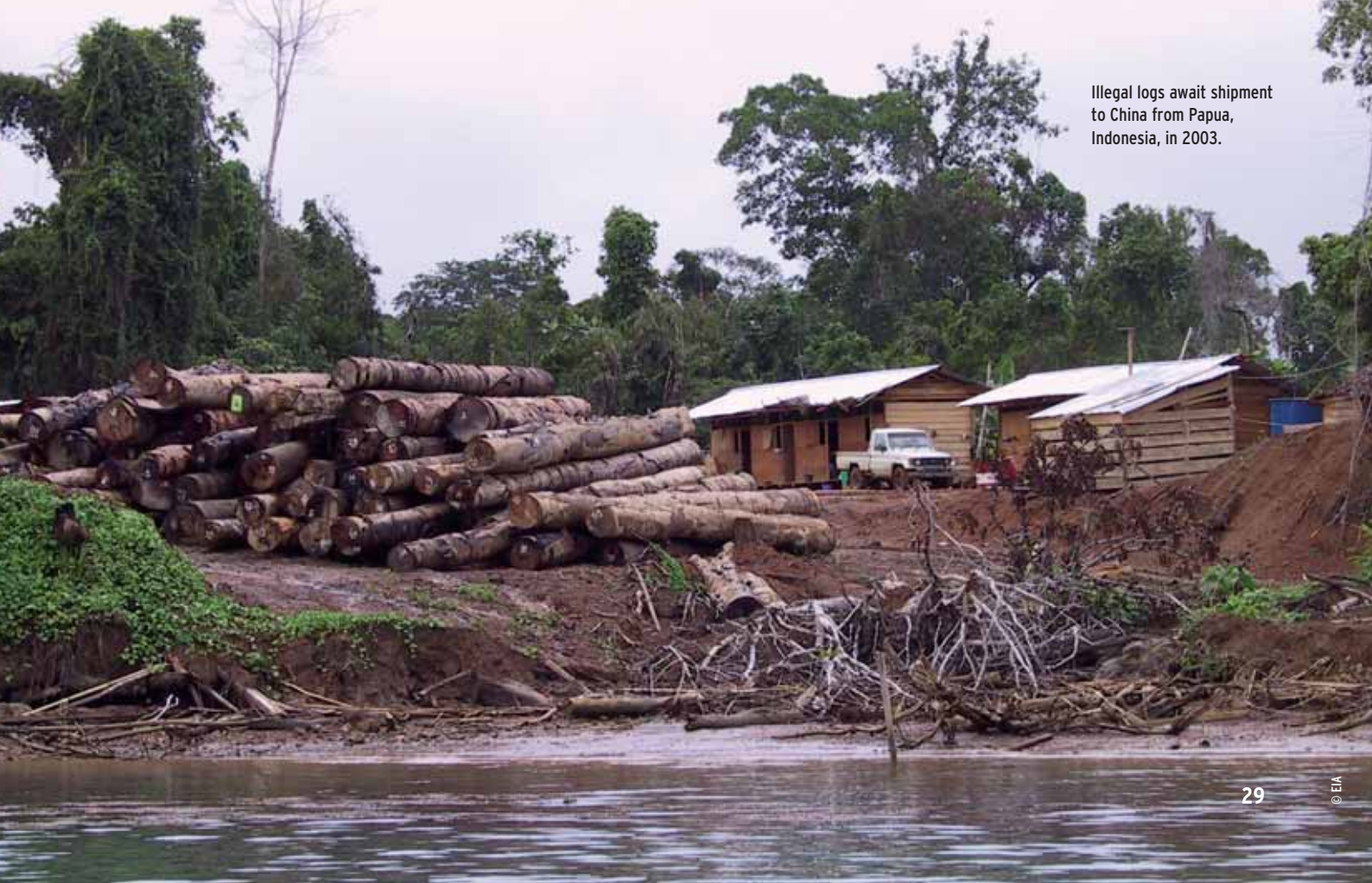
Illegal logs await shipment to China from Papua, Indonesia, in 2003.