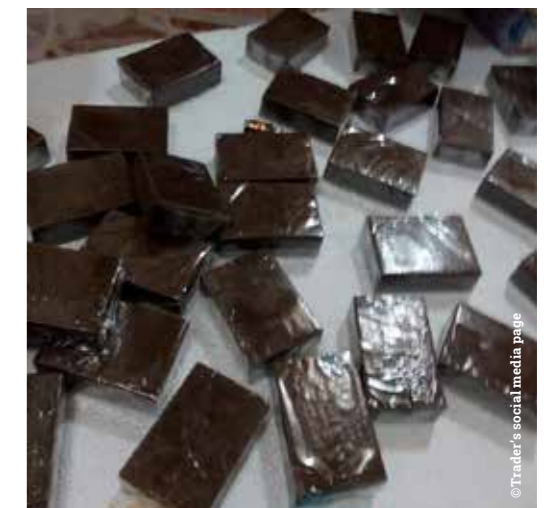
Above: tiger bone glue offered for sale online

Ongoing monitoring suggests that there is a possibility for laundering tigers: the tigers currently in the facility have different stripe patterns and other identifying features compared to those originally found in the facility. 86 Mau Chien's network has been linked to several tiger trade seizures. 87