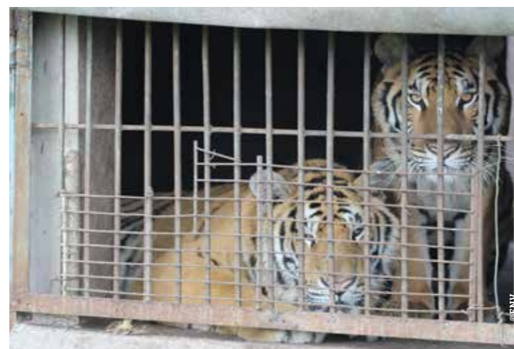
Below: the captive tiger facility of Mau Chien shows how such facilities serve as a front for illegal wildlife trade