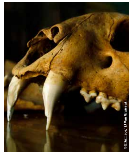
Below: Tiger and other big cat teeth are increasingly desirable, valuable and prevalent in trade

In particular, CITES Decision 17.229 directs the CITES Secretariat to, inter alia , review legal and illegal trade in Asian big cats from or through facilities keeping Asian big cats in captivity, identifying those which may be of concern; and undertake a mission to those Parties in whose territories there are facilities of concern with the purpose of gaining a better understanding of the operations and activities undertaken by them. Decision 17.227 empowers the Standing Committee to determine whether any further time-bound, country-specific actions are necessary. It is critical that the implementation of Decision 17.229 is expedited so that by 2018, a concrete way forward is adopted by the CITES Standing Committee targeting key countries and facilities of concern.