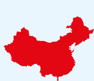
CHINA (mainland) 7