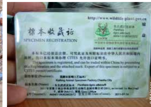
Below and bottom: permit issued by the Chinese Government for a tiger skin rug made from the skin of a captive tiger