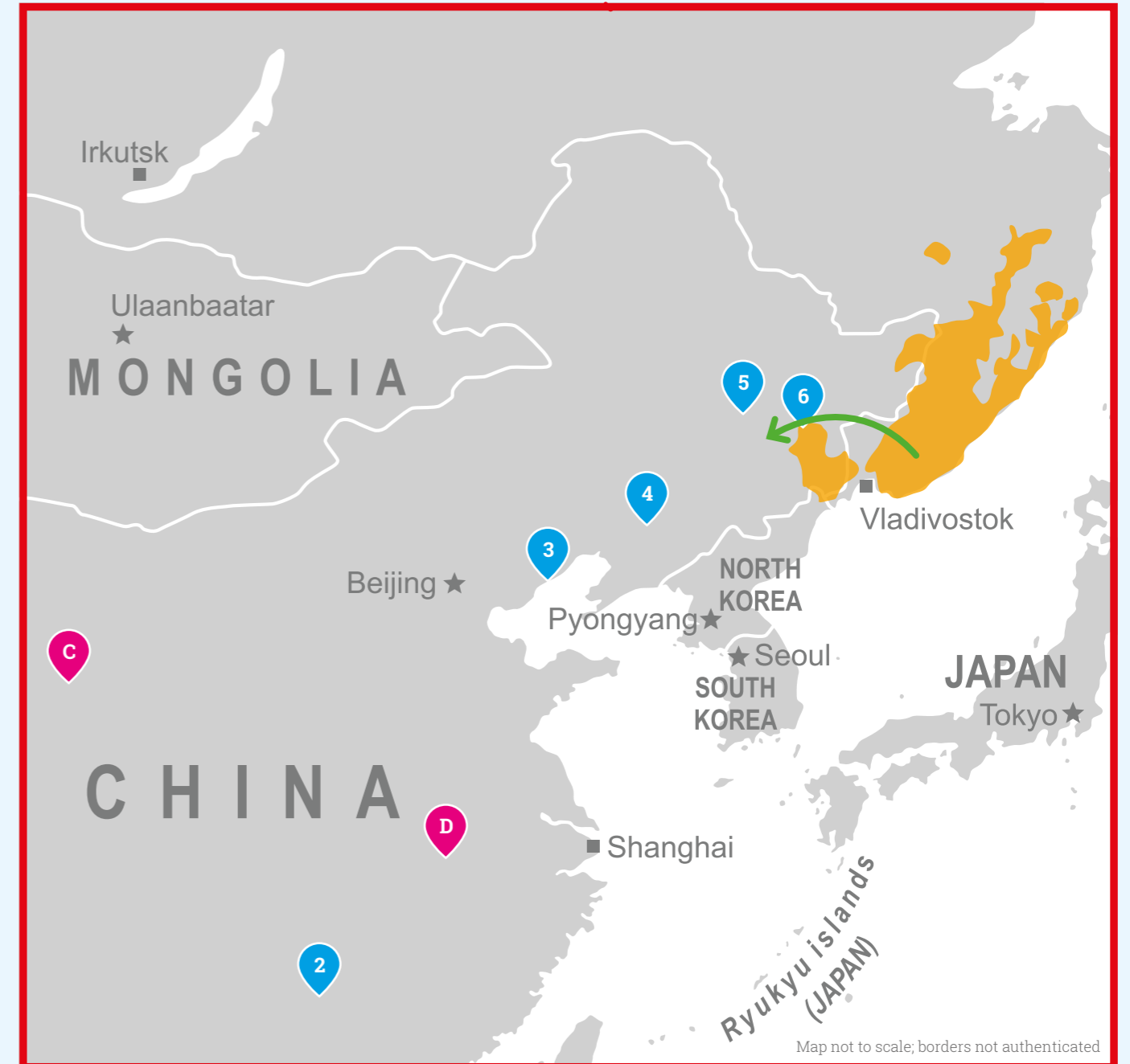
Map not to scale; borders not authenticated