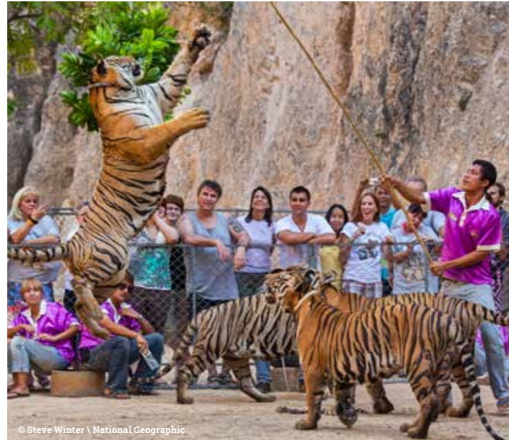
Below: Tigers performing for entertainment at the Tiger Temple in Thailand. Parts of over 70 tigers were seized in the Temple in 2016; no one has been prosecuted

Nearly a decade has passed since the adoption of Decision 14.69, yet countries such as China, Laos, Thailand and Vietnam have drastically expanded tiger farming operations in flagrant non-compliance with this Decision. South Africa too is emerging as a source of captive-bred tiger parts in international trade. Asian big cat captive facilities in these countries play a key role in fuelling trade in captive tiger parts and products, as demonstrated in this report and in an independent assessment conducted on behalf of the CITES Secretariat for the 65th meeting of the CITES Standing Committee (SC65 Doc 38 Annex 1). We call on the CITES Standing Committee which is meeting in November 2017 (SC69) to consider the urgent need to end captive tiger trade and demand for tiger parts and products. The Committee should call for implementation of relevant decisions to achieve this goal. For example, despite the fact that funds have been made available for Laos to conduct an inventory of tiger farms, this is yet to be done. The audit should not be delayed any further because captive tigers in Laos continue to facilitate domestic and international trade.