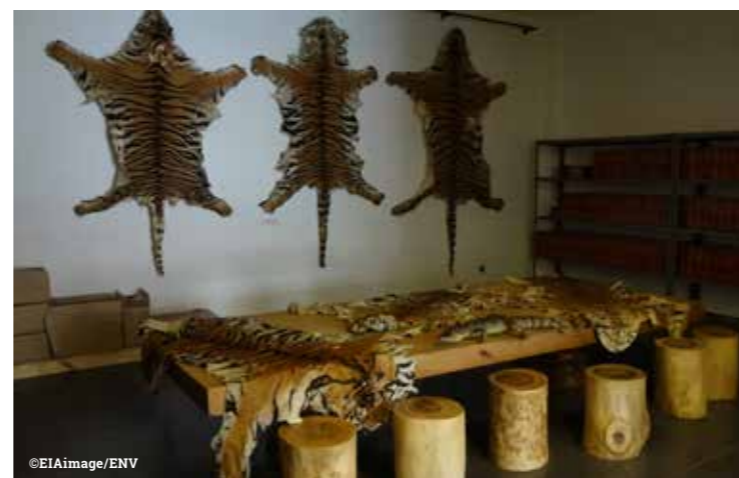
Bottom: tiger skins hung on wall and draped across the table, with boxes of tiger bone wine on shelves at GTSEZ where trade in both wild and captive tiger parts converge