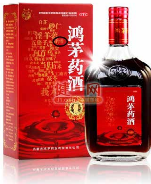
Hongmao Medicinal Wine. The characters for 'leopard bone' (豹骨) are displayed on the product packaging (circled in black).

The likelihood that illegally sourced bone is being used is further substantiated by EIA's historical investigations. In 2008, a director of Qianfang Traditional Chinese Medicine Co. Ltd. showed EIA investigators a fresh clouded leopard ( Neofelis nebulosa ) skeleton, claiming that it was leopard. While the permit issued in March 2018 specifies Panthera pardus , the generic term 豹骨 [baogu], which could refer to the bones of leopard, snow leopard or clouded leopard, is used in the 2006 notifications on leopard bone trade and on the lists of ingredients for products containing leopard bone. Chinese pharmaceutical companies further obfuscate the exact species used by listing non-taxonomic terms such as Os pardus and Os leopardi . It is therefore possible that some proportion of