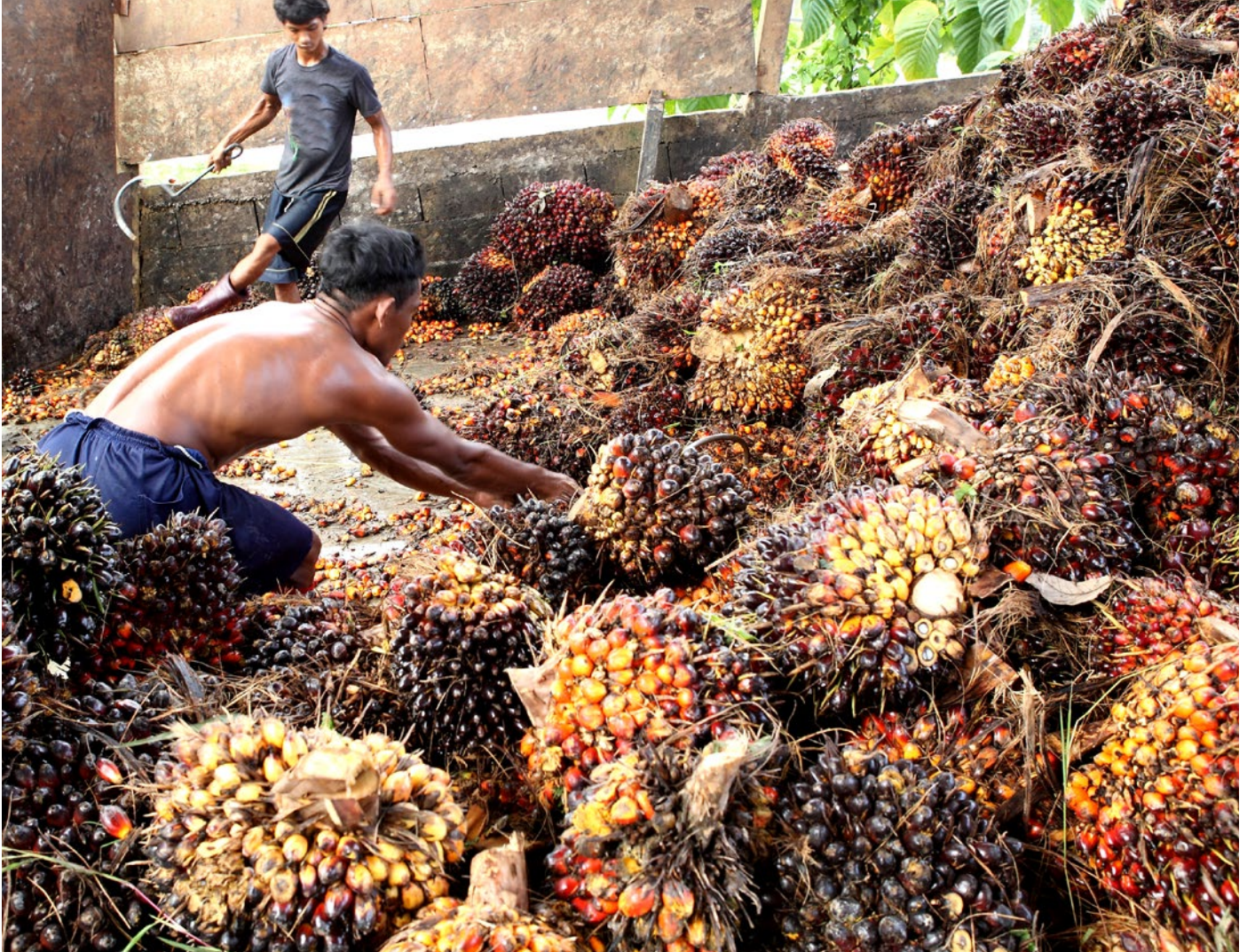
Above: There have been multiple allegations of forced labour by palm oil companies over the past year