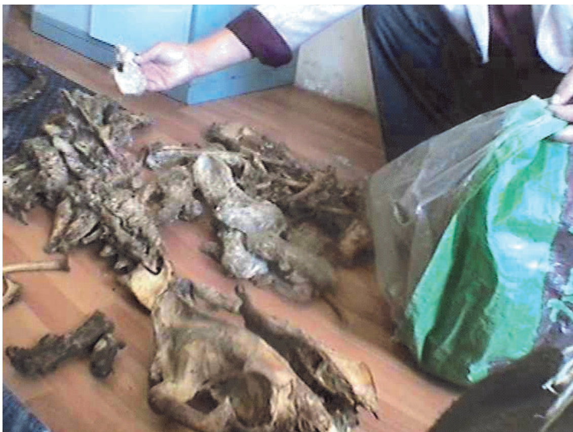
LEFT Straightforward suspect-profiling led investigators to a tiger bone trader in Lhasa.

are put onto China Post trucks for onward delivery. Another leopard skin trader suggested that leopard skin also crosses via Yadong, on the border with India.