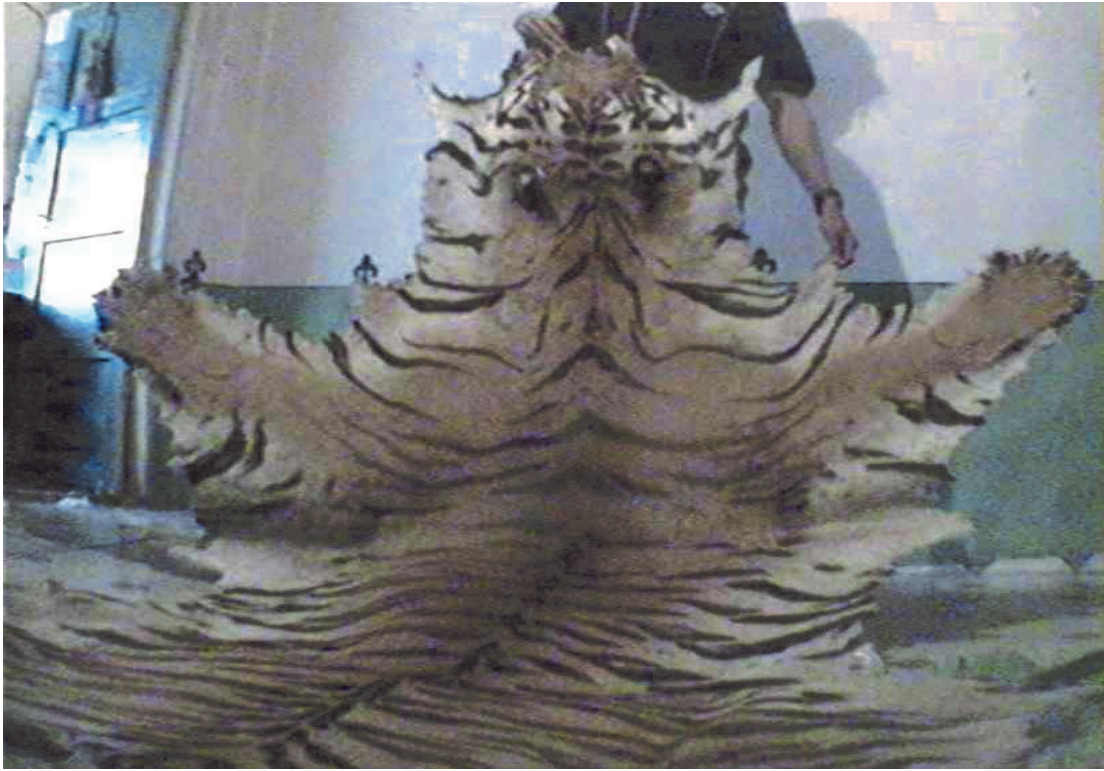
ABOVE Tiger Skin for sale in Lhasa, Tibet Autonomous Region, August 2009

down and he was now operating from the Hui district only.