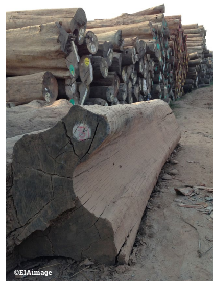
Top and bottom: Myanmar Timber Enterprise depot at Dagon, Yangon, Myanmar, 2013