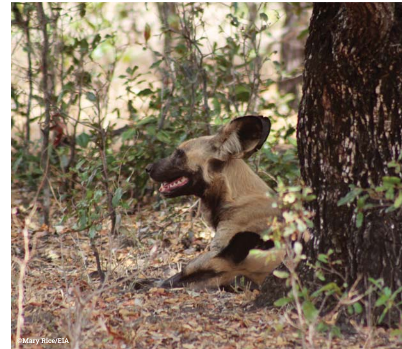
Above: An estimated one-third of the global population of African wild dogs is found in the Selous.

Despite these serious concerns and compelling recommendations to abandon the project, the Government of Tanzania has accelerated the construction of the dam. Construction is now more than halfway complete and the Government has announced its intention to commence filling the reservoir in November 2021. 11