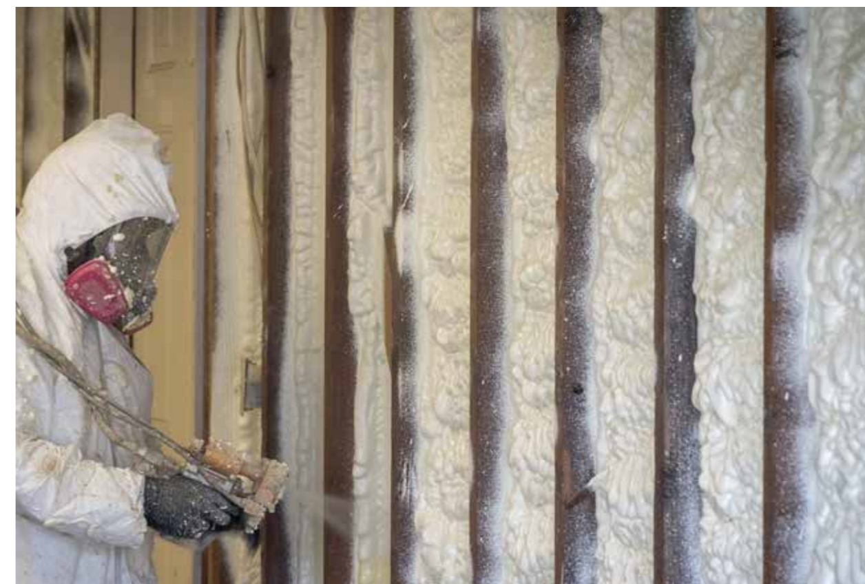
Right: application of spray foam