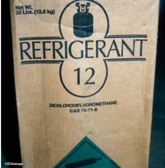
Above: a cylinder of illegal CFC-12 seized in India in 2001

The TEAP Task Force states it is "likely that any new CFC-11 production has occurred is completely independent of CFC-12 use in all R/AC sub-sectors." 9 EIA supports this statement as our evidence strongly suggests that the driver of illegal CFC-11 production is demand for CFC-11 in the foam sector. However, it is possible that significant quantities of CFC-12 have been illegally co-produced. As the use of CFC-12 as a replacement refrigerant for HFC-134a is technically possible, it is important for Parties to explore this further, in particular with respect to the mobile air-conditioning