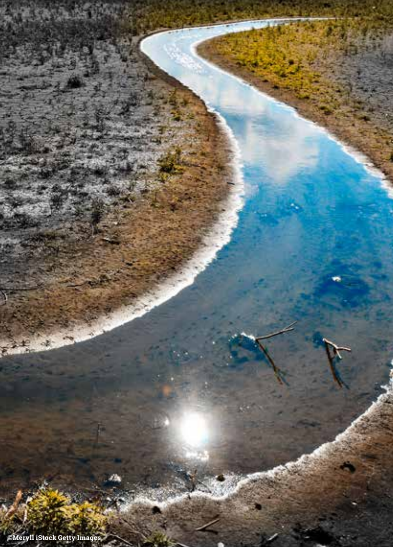
Above: some groundwater samples are already showing higher than permitted TFA levels