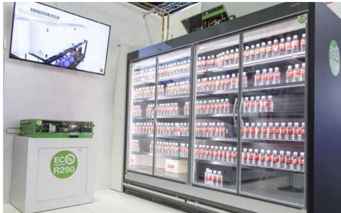
Below: commercial refrigeration system using hydrocarbons

Updates are still needed for air conditioning and heat pump equipment under IEC 60335-2-40. While the standard has been amended to allow increased charge limits of A2L refrigerants, further updates to IEC 60335-2-40 would allow A5 countries to bypass medium-GWP refrigerants directly for more efficient low-GWP hydrocarbons in the room air conditioning sector. Work is ongoing to update IEC 60335-2-40 with a formal proposal, or "Committee Draft for Vote" (CDV). The CDV is anticipated by the end of 2019 and may result in publication of a new edition of the standard by 2021, provided it is approved in two rounds of voting. Active support and engagement by Parties, particularly from member countries in IEC SC61D 52 will be critical to enabling effective implementation of the accelerated HCFC phase-out and the Kigali Amendment.