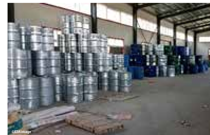
Below: image taken in 2018 in China of raw material used to produce blowing agent