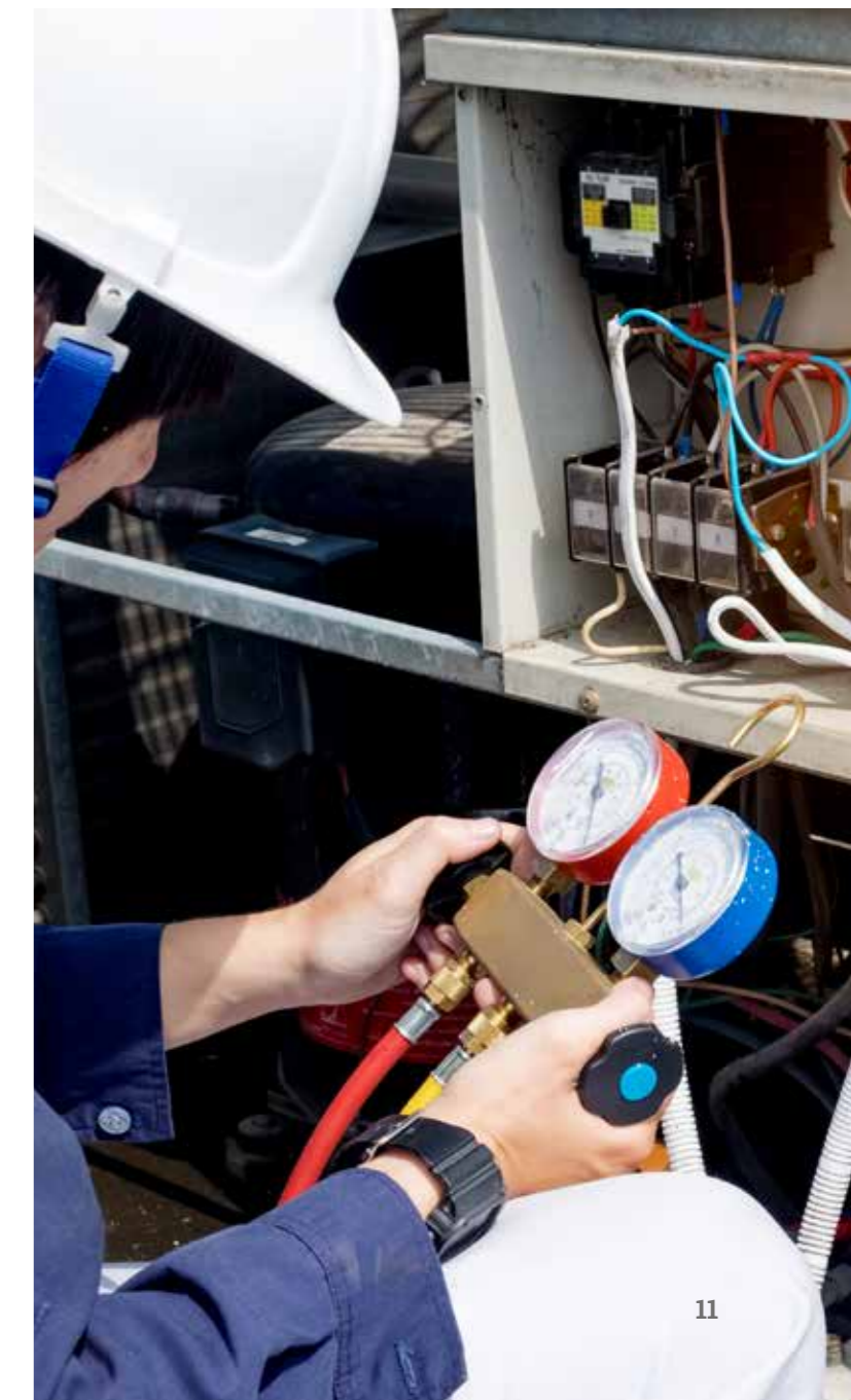
Below: HVACR servicing and maintenance

Europe is already witnessing significant illegal HFC use in the mobile air-conditioning sector, as the F-Gas Regulation is rapidly cutting HFC use and raising prices. 48 Unless strong measures are taken to improve enforcement and close regulatory loopholes, the shift to HFO-1234yf will undoubtedly result in widespread counterfeiting with significant environmental and human safety impacts.